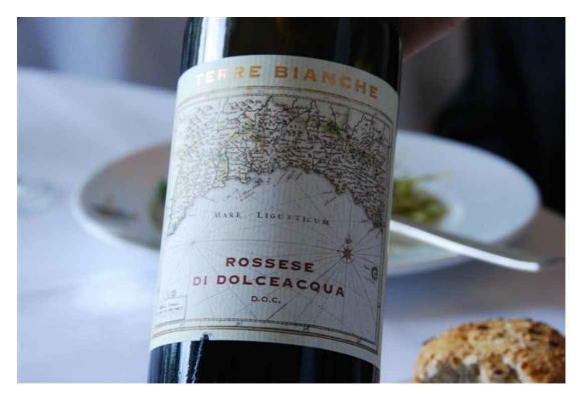
Restaurant Les Bougainvillées-Terre Bianche, Rossese Di Dolceacqua