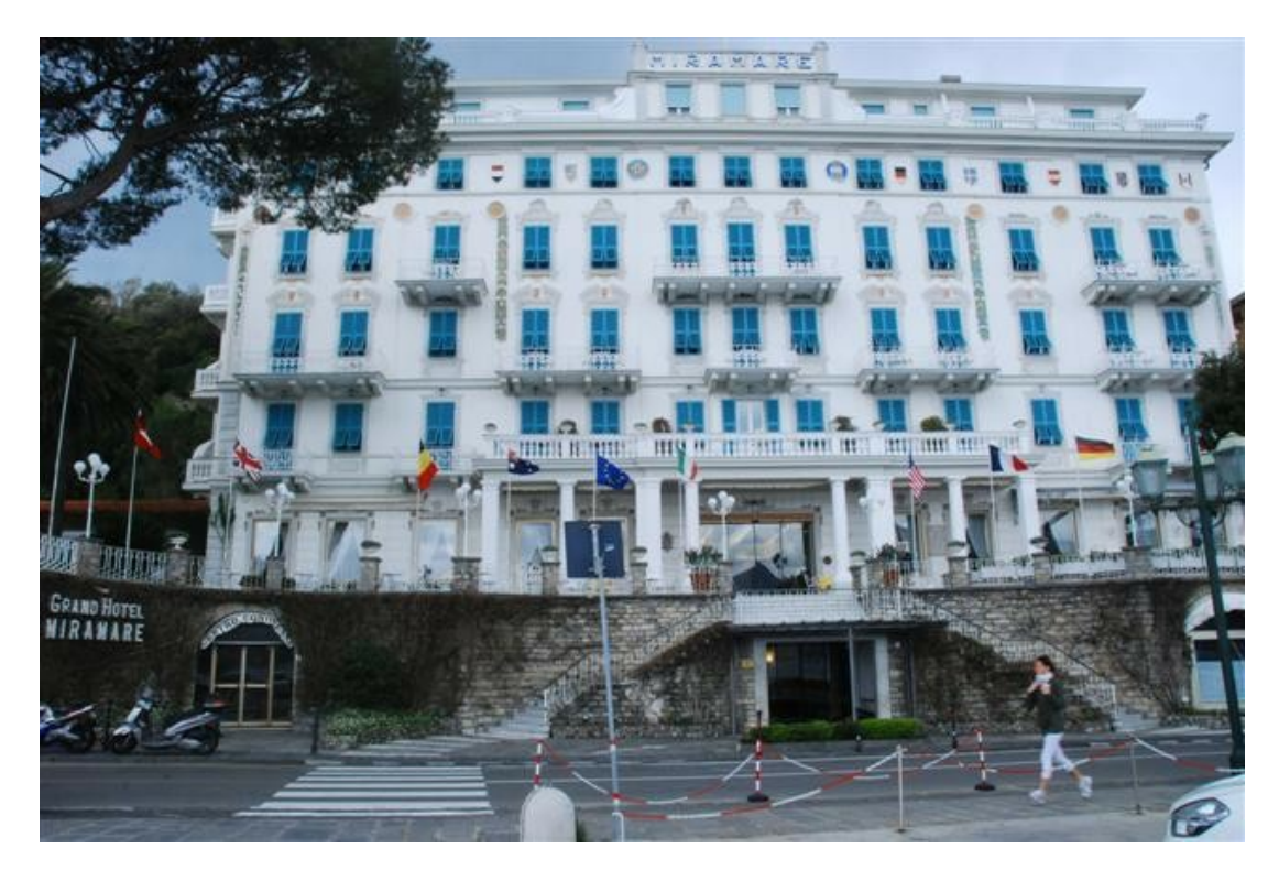
Grand Hotel Miramare