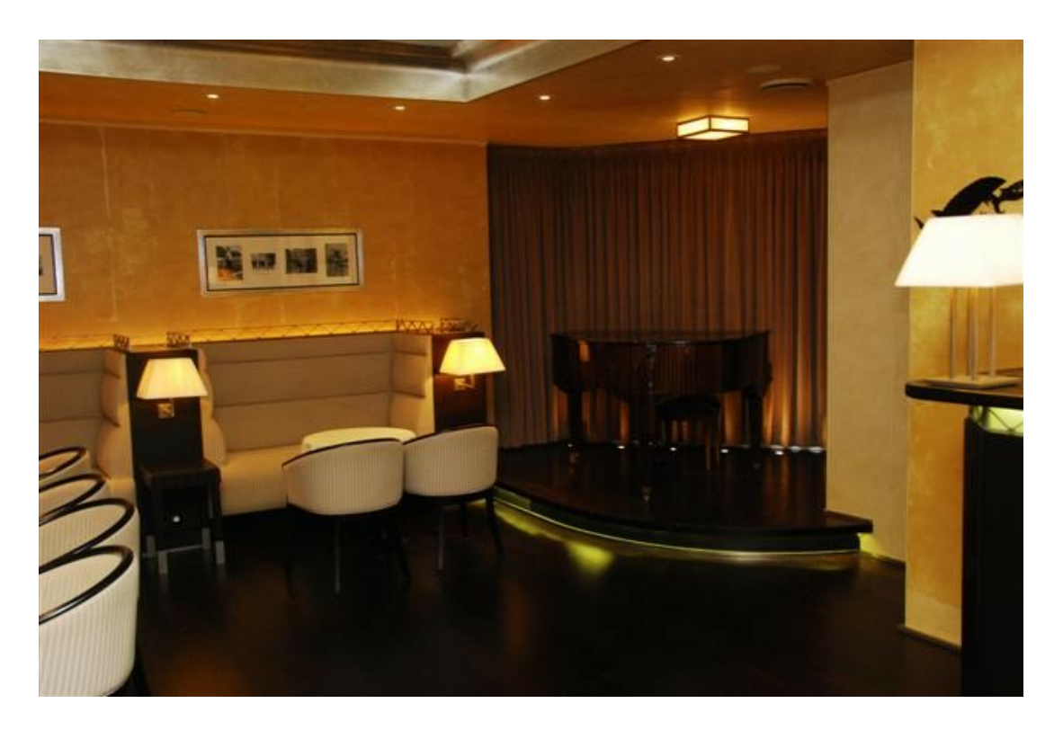
Grand Hotel Miramare - "Barracuda"