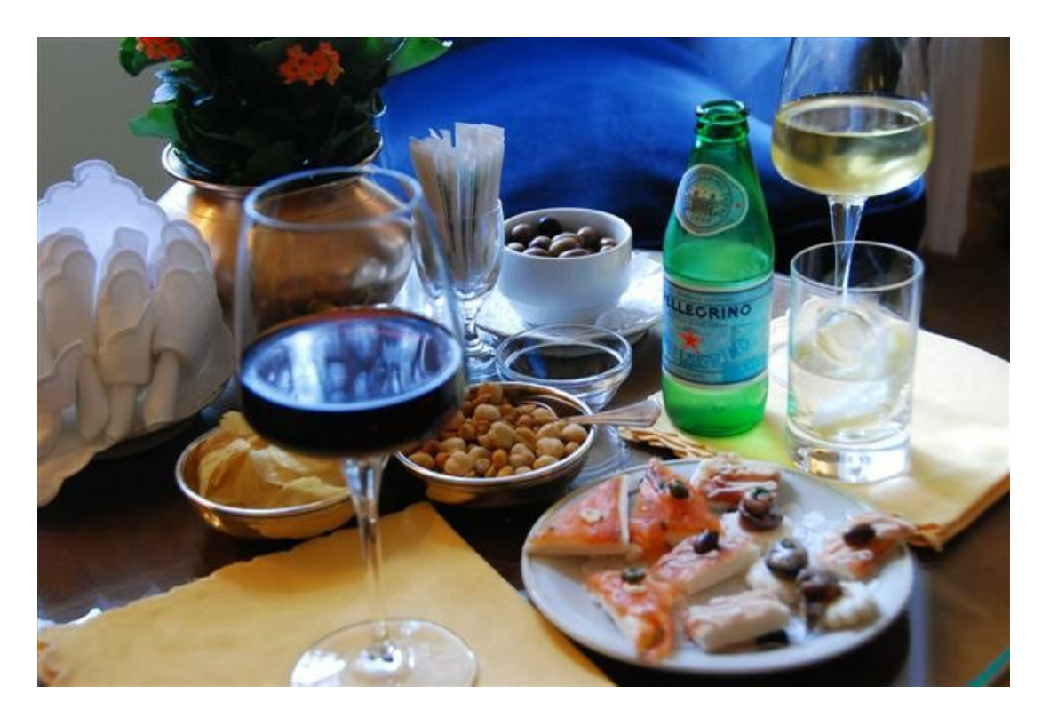
Grand Hotel Miramare - Prelude to Lunch in The Lounge