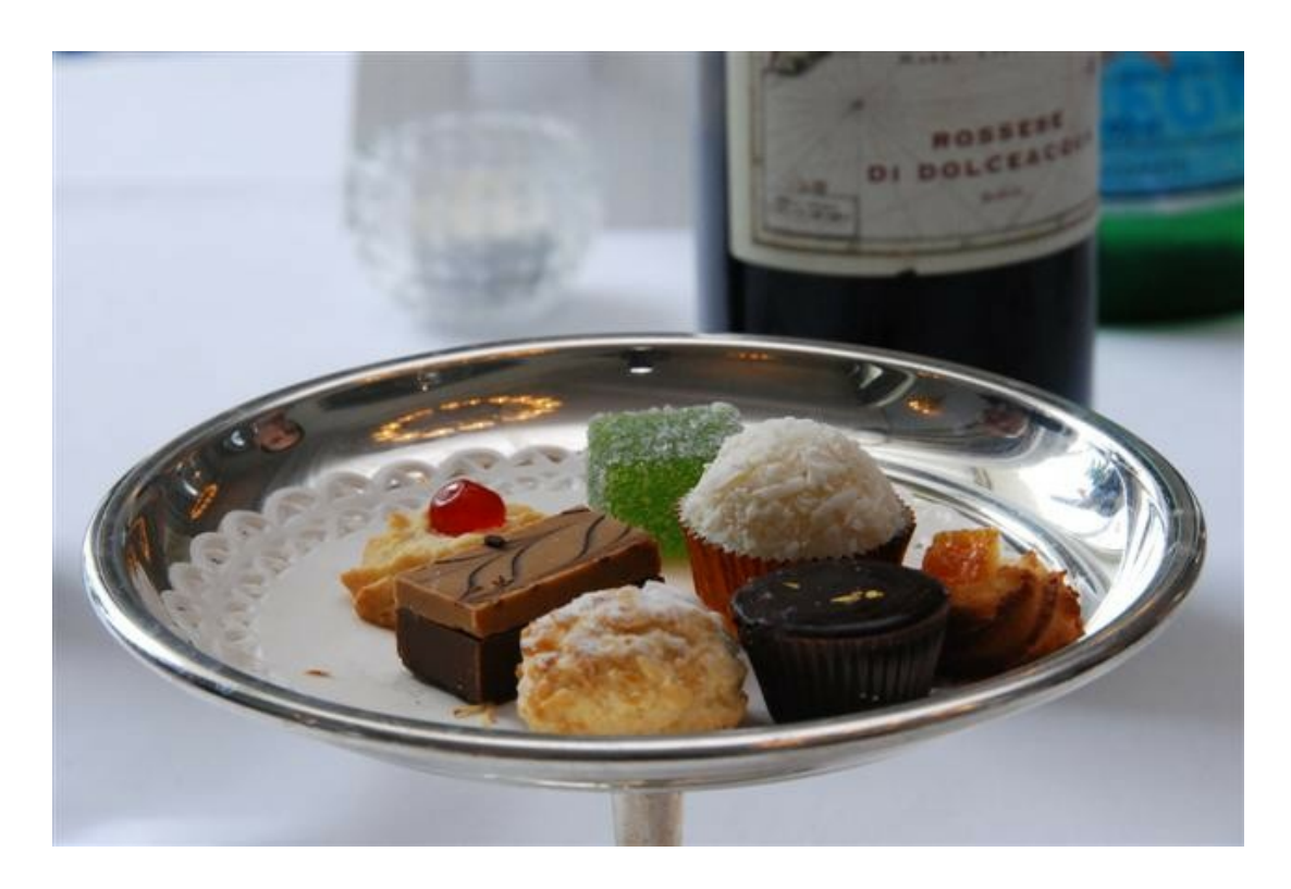
Restaurant Les Bougainvillées - Sweet Treats