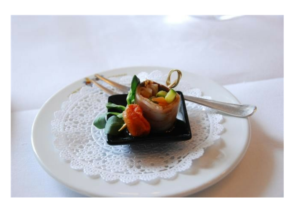
Lunch - Grand Hotel Miramare, Restaurant Les Bougainvillées