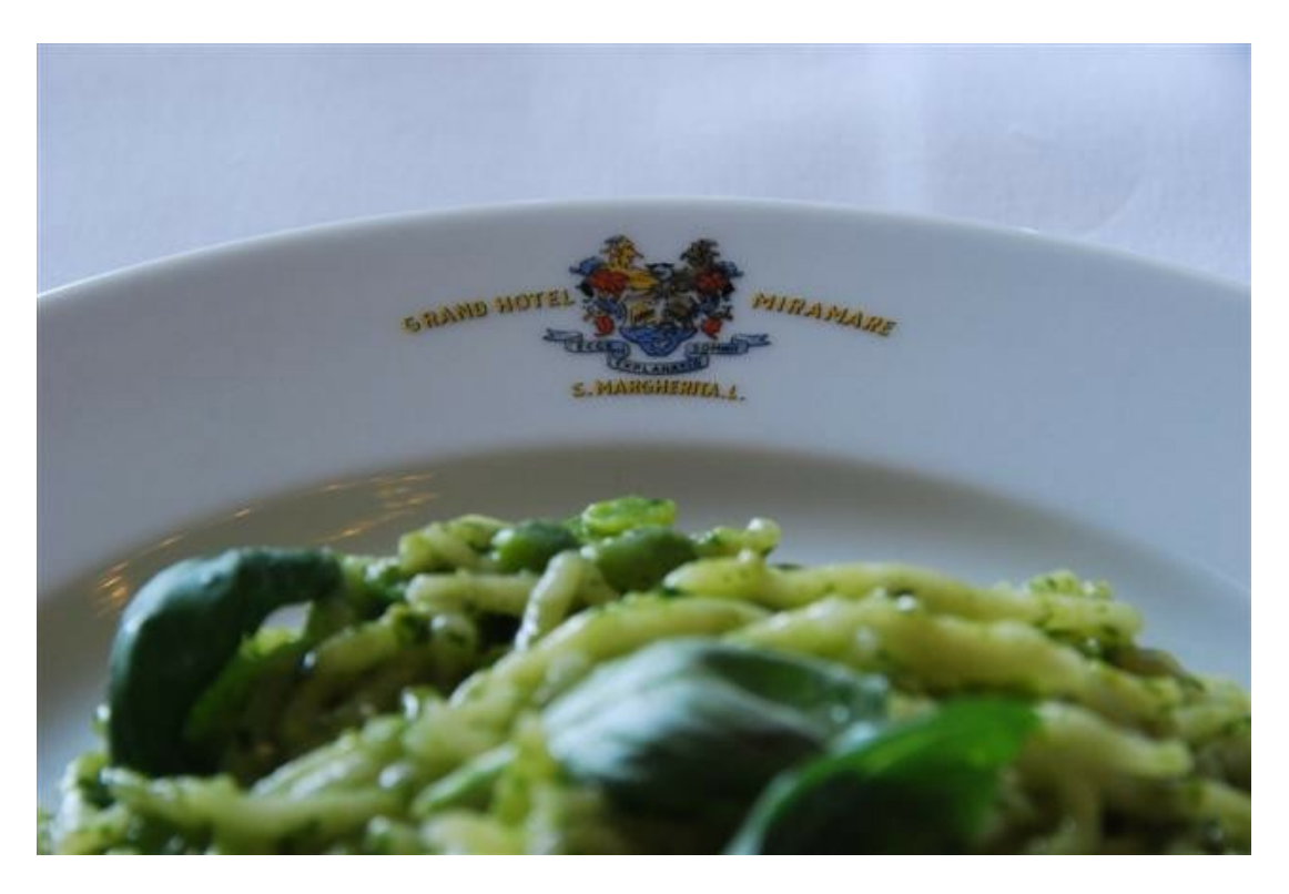
Lunch - Grand Hotel Miramare, Restaurant Les Bougainvillées