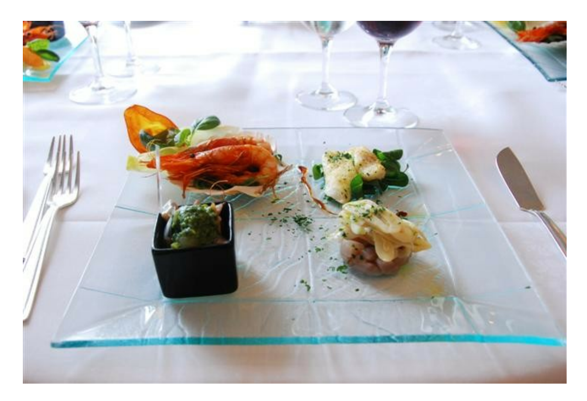
Lunch - Grand Hotel Miramare, Restaurant Les Bougainvillées