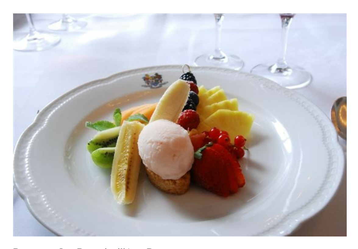
Restaurant Les Bougainvillées - Dessert