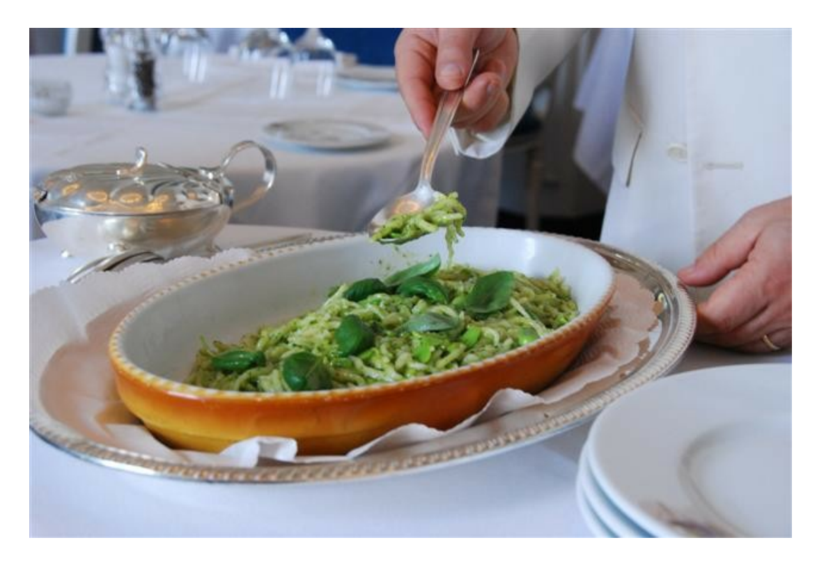
Lunch - Grand Hotel Miramare, Restaurant Les Bougainvillées