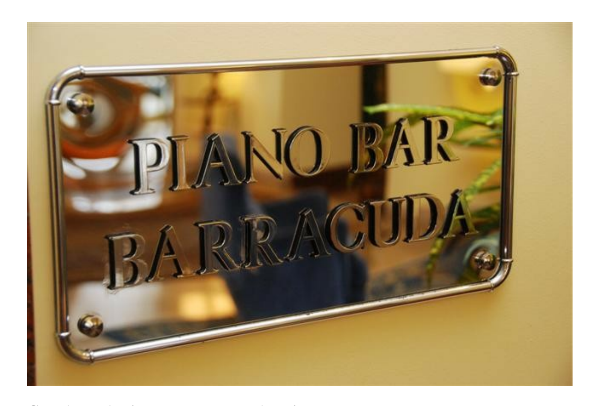
Grand Hotel Miramare - "Barracuda" Piano Bar