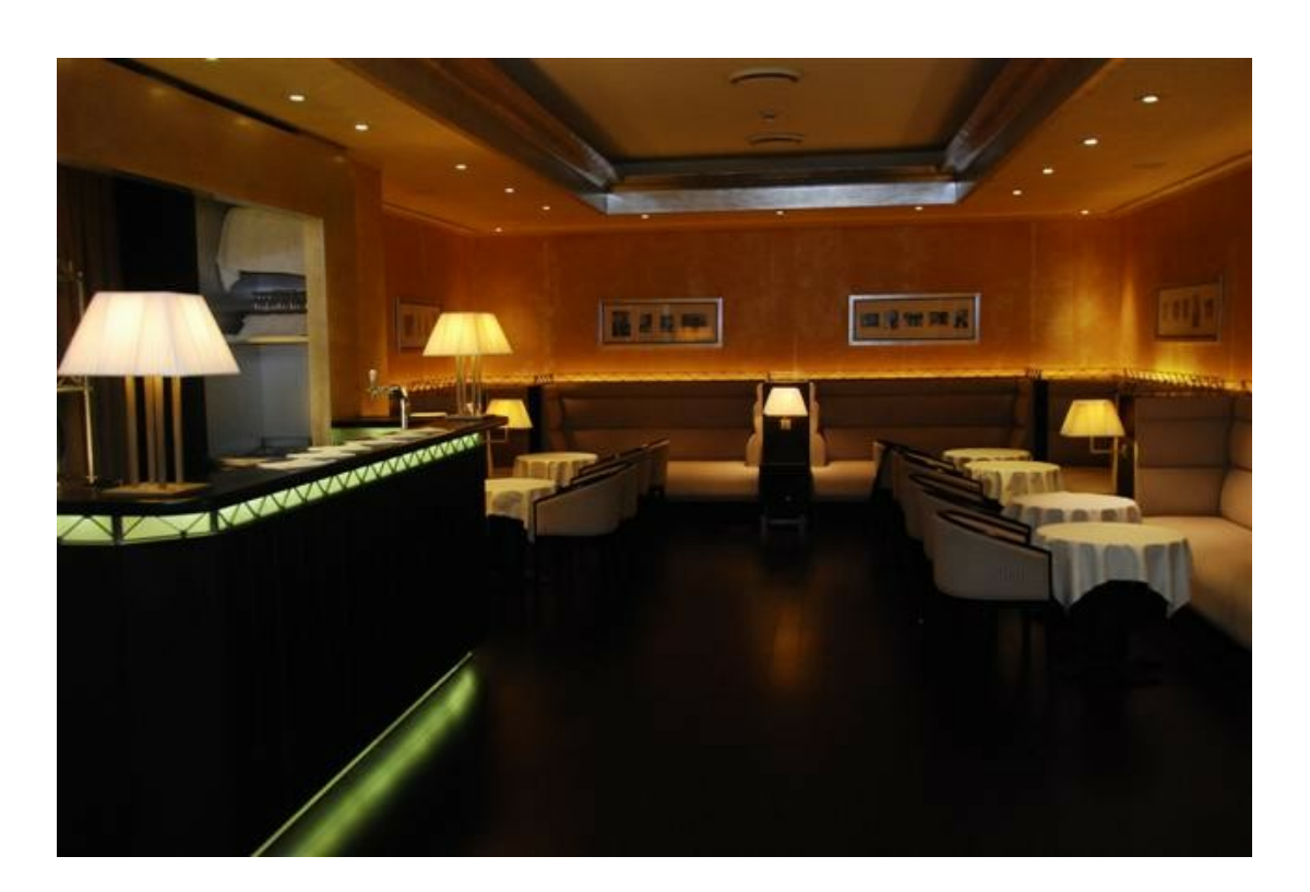
Grand Hotel Miramare - "Barracuda"