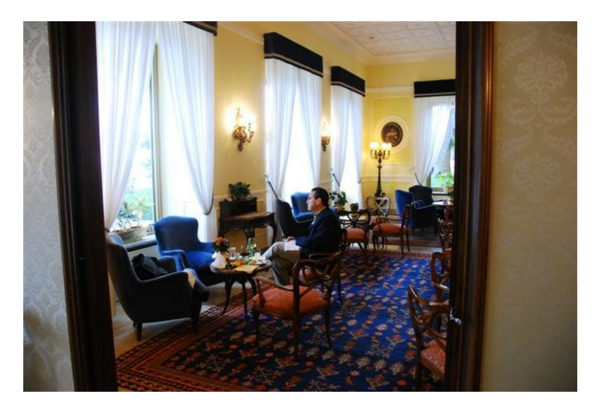
Grand Hotel Miramare - The Lounge