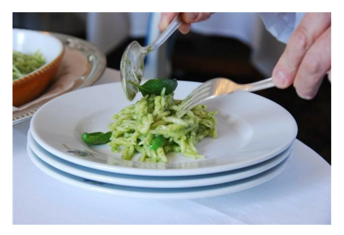
Lunch - Grand Hotel Miramare, Restaurant Les Bougainvillées