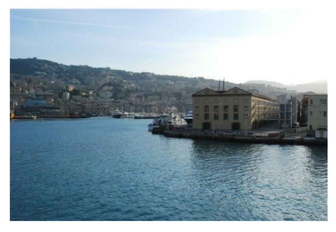
Entering the bay of Genoa

After docking in Genoa we took what seemed to be an hour taxi ride to Santa Margherita for lunch. I know, why should one take a taxi for an hour to Santa Margherita for lunch? Well, this was no ordinary lunch as I was on my way back to a fantastic property I fell in love with several years ago and to see a dear friend. It's often said that one can never step into the same lake twice but I do delight in the pleasure found in my returns. Finally, <u>Grand Hotel Miramare</u> appeared and I immediately picked up where I left off – the bar. I was a bit early so snacks and a little Ligurian wine was the perfect prelude to lunch.