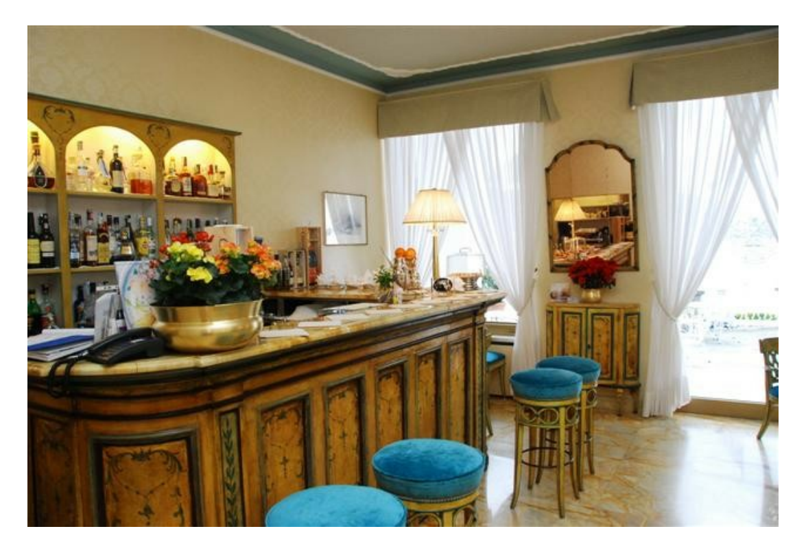
Grand Hotel Miramare - The Bar