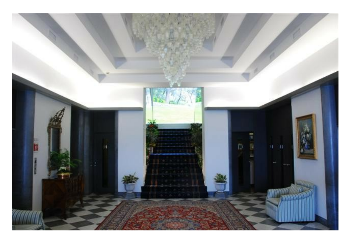
Grand Hotel Miramare - Lobby