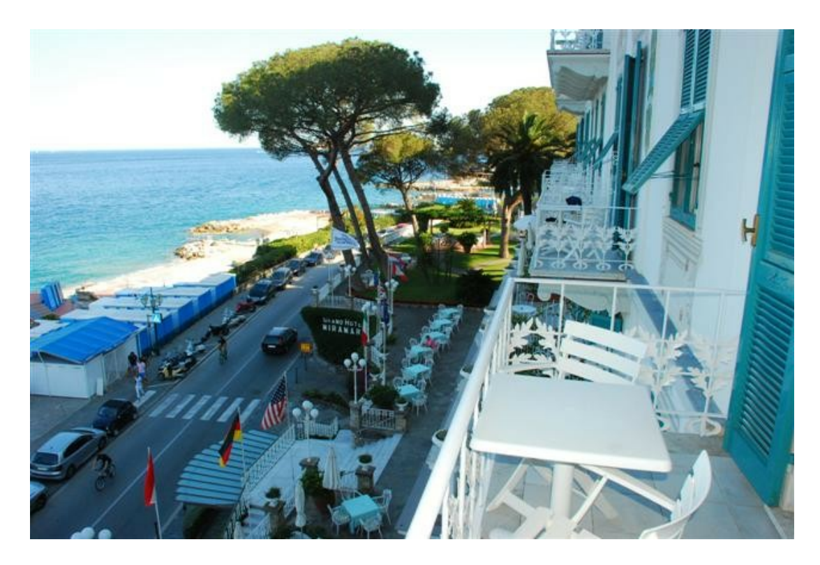
Grand Hotel Miramare - May 2007