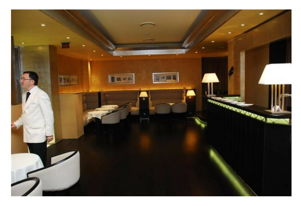
Grand Hotel Miramare - "Barracuda"