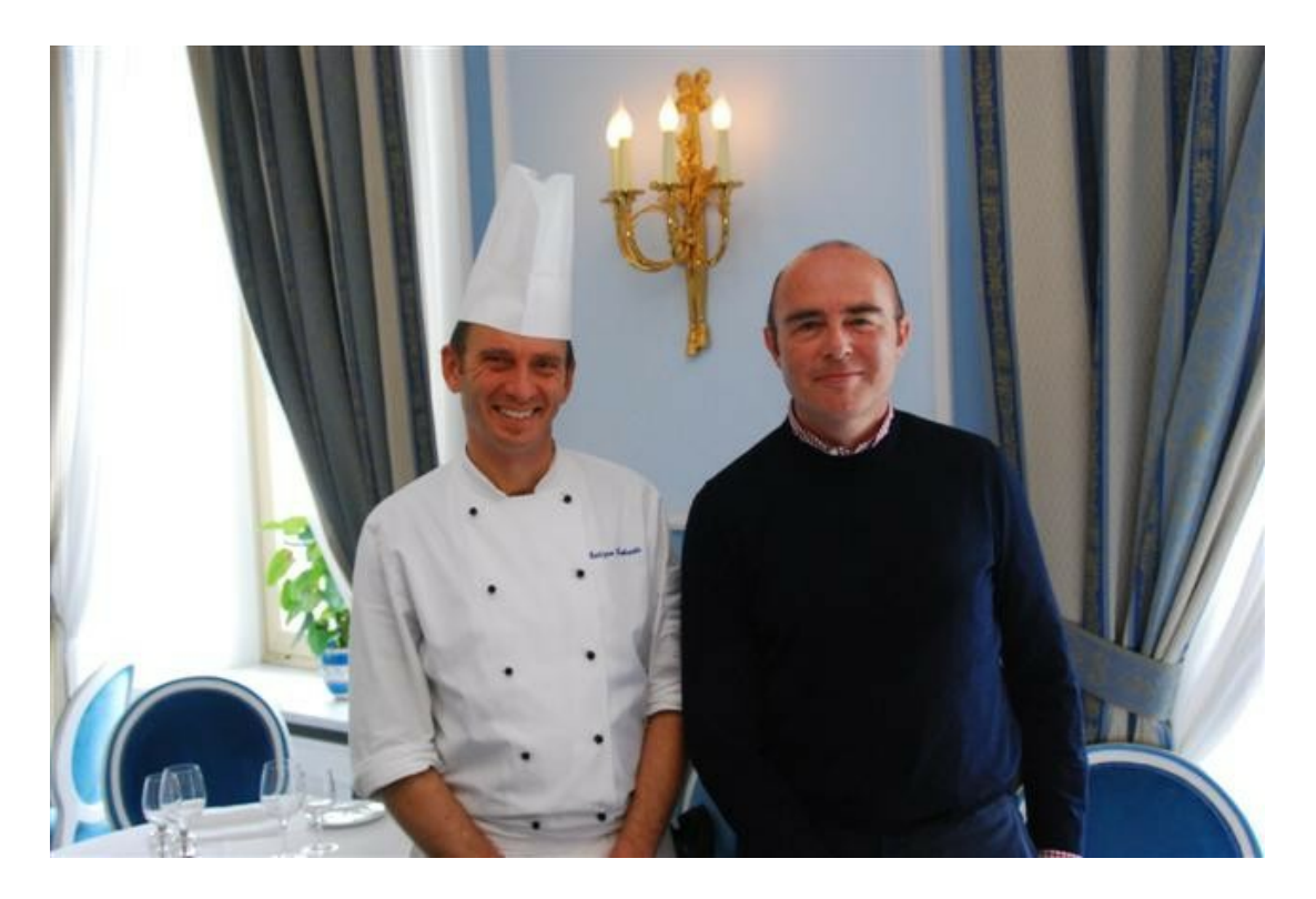
Restaurant Les Bougainvillées